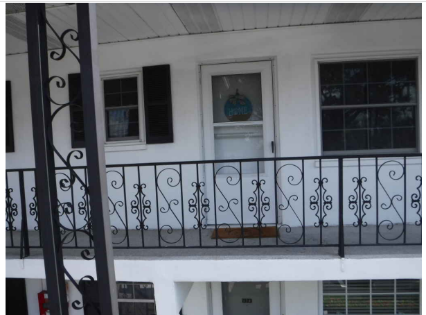
Title: Unit used for attic access.